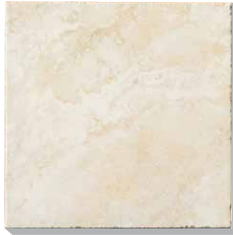
3Y06 Augusto BG 20"x20" 3Y02 Augusto BG 13"x13"