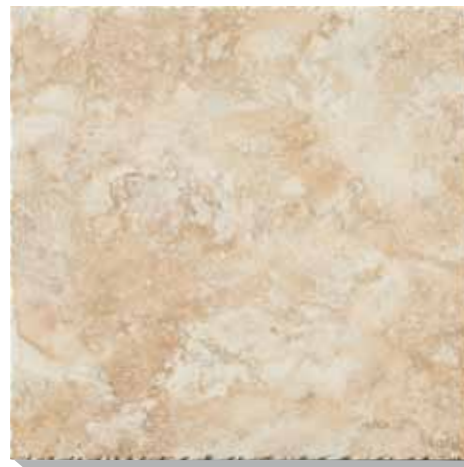
3Y08 Aureliano TO 20"x20" 3Y04 Aureliano TO 13"x13"