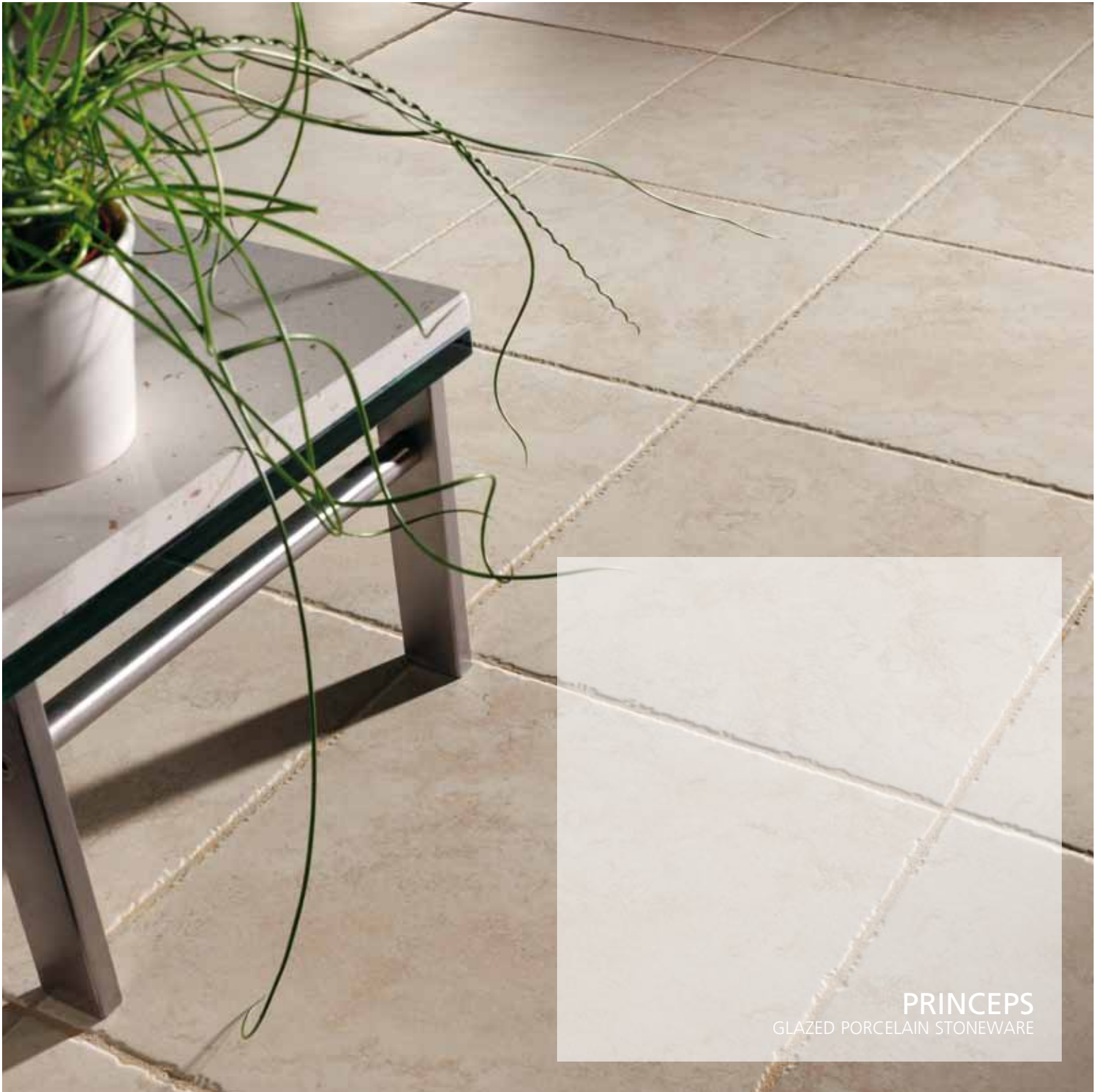
PRINCEPS GLAZED PORCELAIN STONEWARE