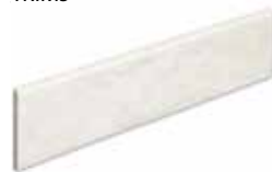
3X00 Cesare BI Bullnose 3Y99 Augusto BG Bullnose 3Y98 Tiberio NO Bullnose 3X01 Aureliano TO Bullnose 3 1/8 "x13"