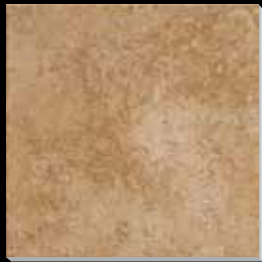
AF2A Status BG 12"x12"