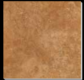
AF2B Status MT 12"x12"