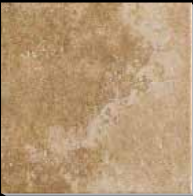
AF2D Status BG 18"x18"