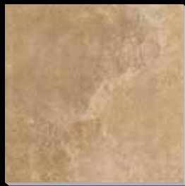
AF2C Status NO 12"x12"