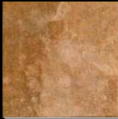
AF2E Status MT 18"x18"