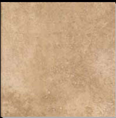
AF2F Status NO 18"x18"