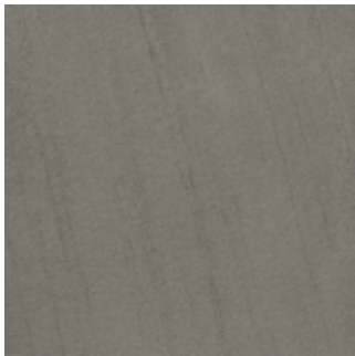
R28U Lifestyle AN 24" x 48" Rectified R26G Lifestyle AN 24" x 24" Rectified R26Q Lifestyle AN 12" x 24" Rectified