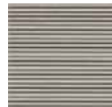
R2CW Lifestyle GR Strip Mosaic 12" x 12"