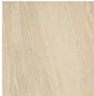
R28S Lifestyle BG 24" x 48" Rectified R26E Lifestyle BG 24" x 24" Rectified R26N Lifestyle BG 12" x 24" Rectified