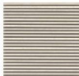
R2CV Lifestyle BI Strip Mosaic 12" x 12"