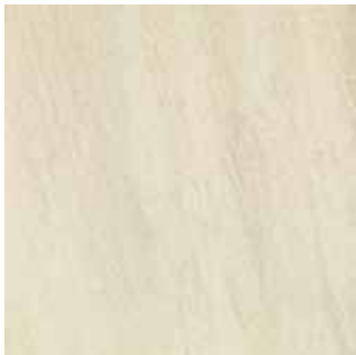
R28R Lifestyle BI 24" x 48" Rectified R26D Lifestyle BI 24" x 24" Rectified R26M Lifestyle BI 12" x 24" Rectified