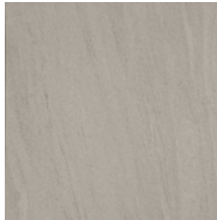
R28T Lifestyle GR 24" x 48" Rectified R26F Lifestyle GR 24" x 24" Rectified R26P Lifestyle GR 12" x 24" Rectified