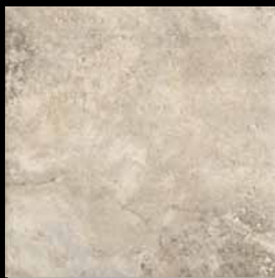
AG2V Bombay BG