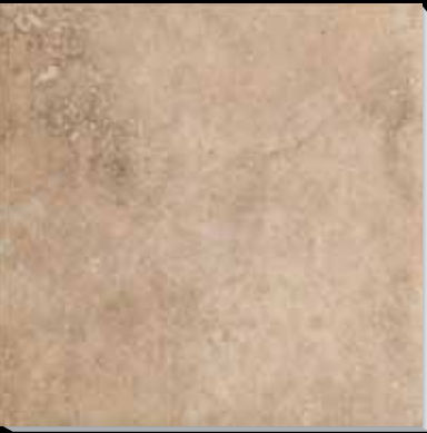
AG2X Sydney NO 18" x 18" AG2U Sydney NO 12" x 12" AG2R Sydney NO 6" x 6"