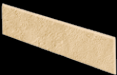
AG3C Bombay BG Bullnose AG3D Boston GR Bullnose AG3E Sydney NO Bullnose 3" x 12"