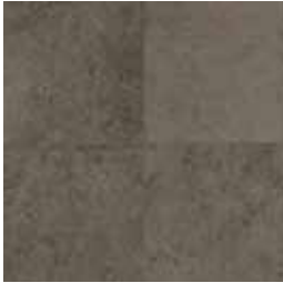
Limestone AN AL2F 3¼"x6½" Rectified AL2C 6"x24" Rectified AL23 12"x24" Rectified AL29 13"x13" Rectified AL26 20"x20" Rectified

COLOR BODY PORCELAIN TILE | RECTIFIED | 3D PRINTING TECHNIQUE