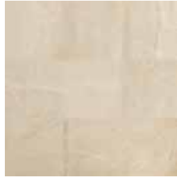
Limestone BI AL2E 3¼"x6½" Rectified AL2B 6"x24" Rectified AL22 12"x24" Rectified AL28 13"x13" Rectified AL25 20"x20" Rectified