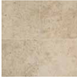
Limestone BG AL2G 3¼"x6½" Rectified AL2D 6"x24" Rectified AL24 12"x24" Rectified AL2A 13"x13" Rectified AL27 20"x20" Rectified