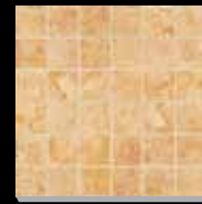
AF2M Solar Swish GI Mosaic - Square 2"x2" 13"x13"