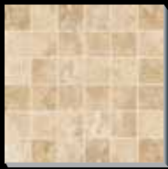
AF2H Snow Ball BI Mosaic - Square 2"x2" 13"x13"