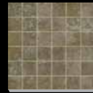
AF2N Green Valley VE Mosaic - Square 2" x 2" 13" x 13"