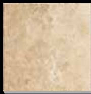
R596 Snow Ball BI 13"x13"