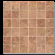
AF2J Sun Flash RS Mosaic - Square 2" x 2" 13" x 13"