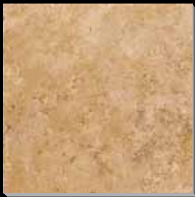
R594 Cliff Tail NO 20" x 20"