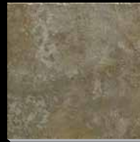
RD97 Green Valley VE 20" x 20"