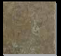
RD96 Green Valley VE 13" x 13"