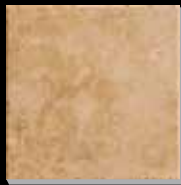
R599 Cliff Tail NO 13" x 13"