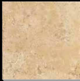
R593 Gold Wing BG 20"x20"