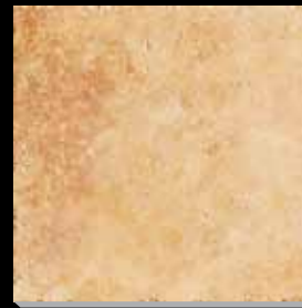
R595 Solar Swish GI 20"x20"