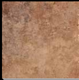
R592 Sun Flash RS 20" x 20"