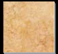
R600 Solar Swish GI 13"x13"