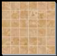
AF2L Cliff Tail NO Mosaic - Square 2" x 2" 13" x 13"