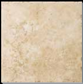
R591 Snow Ball BI 20"x20"