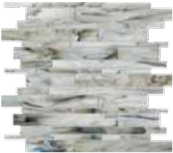
UJ9X Smokey Stiletto Random Mosaic 12"x12"