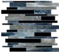
UJ9Z Steel Toe Random Mosaic 12"x12"