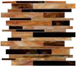
UJ9T Chocolate Clog Random Mosaic 12"x12"