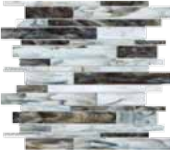
UJ9Y Sable Slipper Random Mosaic 12"x12"