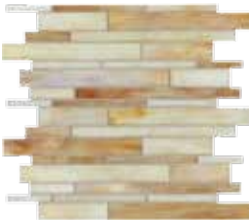
UJ92 Toffee Tennies Random Mosaic 12"x12"