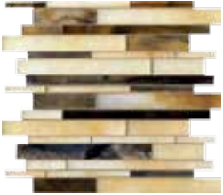
UJ9V Olive Oxfords Random Mosaic 12"x12"