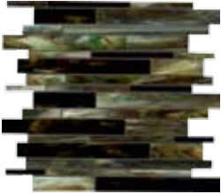
UJ9U Jade Jellies Random Mosaic 12"x12"