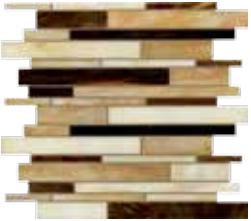
UJ9W Pecan Pump Random Mosaic 12"x12"