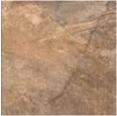
AF3Q Burgundy NO 20"x20" AF3L Burgundy NO 13"x13" AF58 Burgundy NO 6 1/2"x6 1/2"