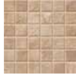
AG58 Burgundy GR Mosaic - Square 2"x2" 13"x13"