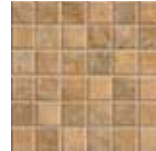
AG59 Burgundy GO Mosaic - Square 2"x2" 13"x13"