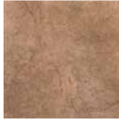
AF3R Burgundy TC 20"x20" AF3M Burgundy TC 13"x13" AF59 Burgundy TC 6 1/2"x6 1/2"