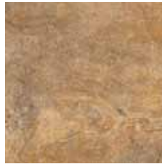
AF3P Burgundy GO 20"x20" AF3K Burgundy GO 13"x13" AF57 Burgundy GO 6 1/2"x6 1/2"