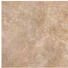
AF3N Burgundy GR 20"x20" AF3J Burgundy GR 13"x13" AF56 Burgundy GR 6 1/2"x6 1/2"