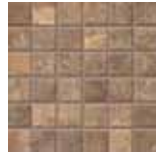
AG6A Burgundy NO Mosaic - Square 2"x2" 13"x13"