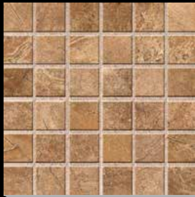
AG6B Burgundy TC Mosaic - Square 2"x2" 13"x13"