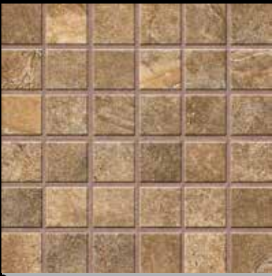
AG6A Burgundy NO Mosaic - Square 2"x2" 13"x13"