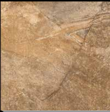
AF3O Burgundy NO 20" x 20" AF3L Burgundy NO 13" x 13" AF58 Burgundy NO 6 1/2" x 6 1/2"