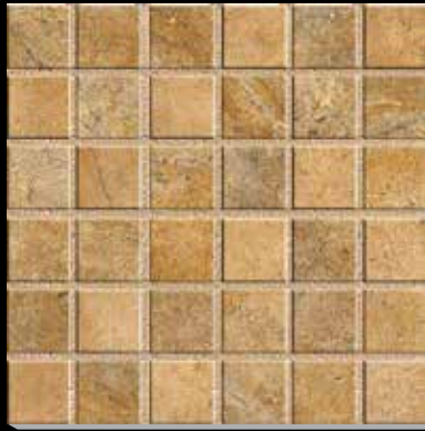
AG59 Burgundy GO Mosaic - Square 2"x2" 13"x13"