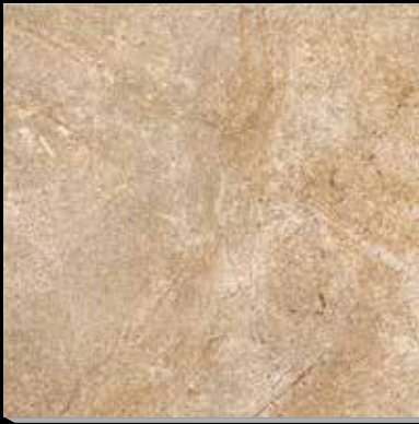
AF3N Burgundy GR 20" x 20" AF3J Burgundy GR 13" x 13" AF56 Burgundy GR 6 1/2" x 6 1/2"