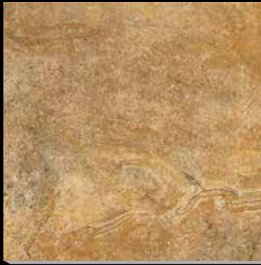
AF3P Burgundy GO 20" x 20" AF3K Burgundy GO 13" x 13" AF57 Burgundy GO 6 1/2" x 6 1/2"