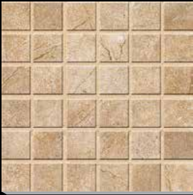
AG58 Burgundy GR Mosaic - Square 2"x2" 13"x13"