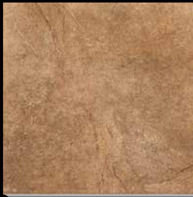
AF3R Burgundy TC 20" x 20" AF3M Burgundy TC 13" x 13" AF59 Burgundy TC 6 1/2" x 6 1/2"