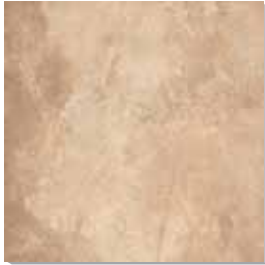
AG2E Cassino BG 18"x18" AG2A Cassino BG 12"x12"