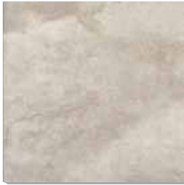
AG2H Siena GR 18"x18" AG2D Siena GR 12"x12"