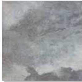
AG2F Orvieto BL 18"x18" AG2B Orvieto BL 12"x12"