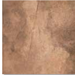
AG2G Perugia MA 18"x18" AG2C Perugia MA 12"x12"