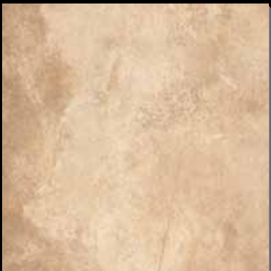
AG2E Cassino BG 18"x18"