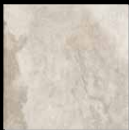
AG2D Siena GR 12"x12"