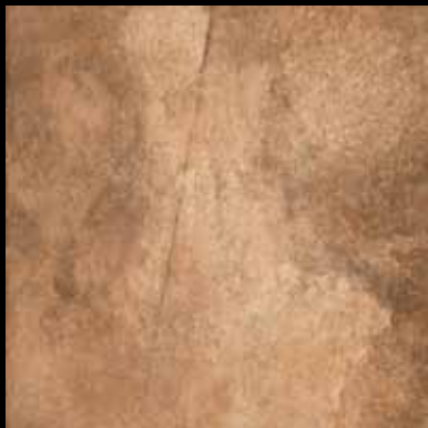
AG2G Perugia MA 18"x18"