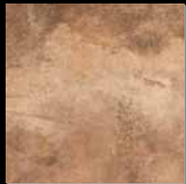
AG2C Perugia MA 12"x12"