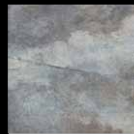
AG2B Orvieto BL 12"x12"