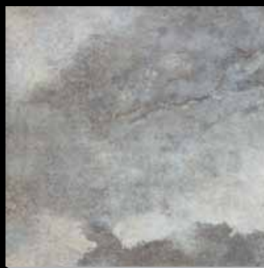
AG2F Orvieto BL 18"x18"