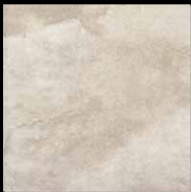
AG2H Siena GR 18"x18"