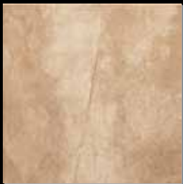
AG2A Cassino BG 12"x12"