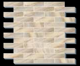
AJ57 Boardwalk GR Mosaic - Brick 1" x 4 1/4" 13" x 13"