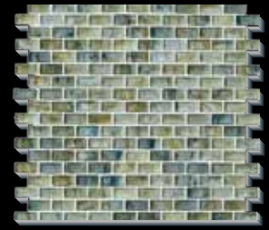
UJAF Jive Mosaic - Brick 1 1/4" x 5/8" 13" x 13"