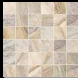
AJ54 Boardwalk GR Mosaic - Square 2" x 2" 13" x 13"