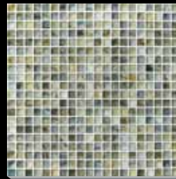
UJ99 Jive Mosaic - Square 5/8" x 5/8" 13" x 13"