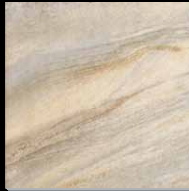
AJ4C Boardwalk GR 20" x 20"