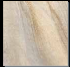
AJ39 Boardwalk GR 13" x 13"