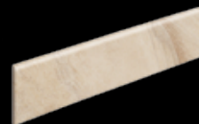
AJ4L Boardwalk BG Bullnose AJ4M Boardwalk GR Bullnose AJ4N Boardwalk MC Bullnose 3" x 13"