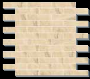
AJ56 Boardwalk BG Mosaic - Brick 1" x 4 1/4" 13" x 13"