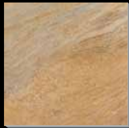
AJ4A Boardwalk MC 13" x 13"