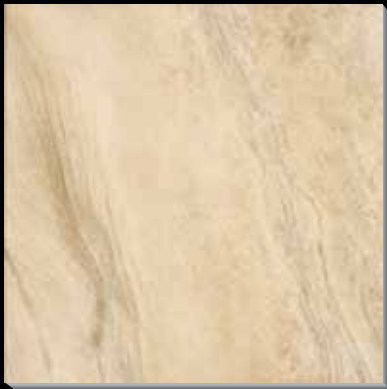
AJ4B Boardwalk BG 20" x 20"