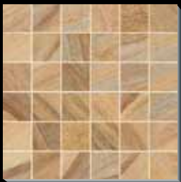
AJ55 Boardwalk MC Mosaic - Square 2" x 2" 13" x 13"