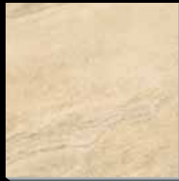
AJ38 Boardwalk BG 13" x 13"