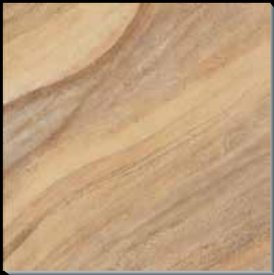
AJ4D Boardwalk MC 20" x 20"