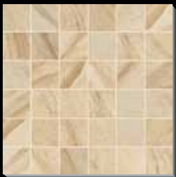
AJ53 Boardwalk BG Mosaic - Square 2" x 2" 13" x 13"