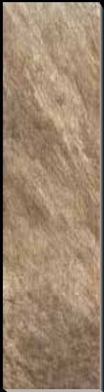
AM4H Ash 6"x24"