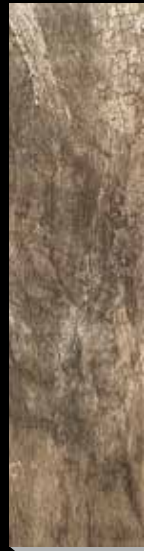
AM4J Barley 6"x24"