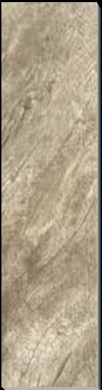
AM4K Pearl 6"x24"