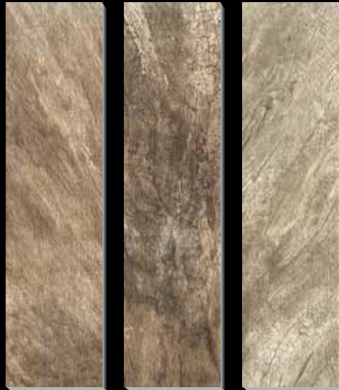
AM4L Blend* 6"x24"

*Blend is a combination of Ash, Barley and Pearl Colors are randomly packaged.